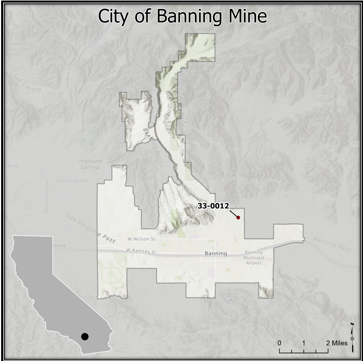
Figure 1. Existing Surface Mines in Lead Agency's Jurisdiction during Review Period (2014-2018) *

*See mine identification legend in Table 1.