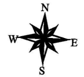
Plate 1 Map 10 of 19