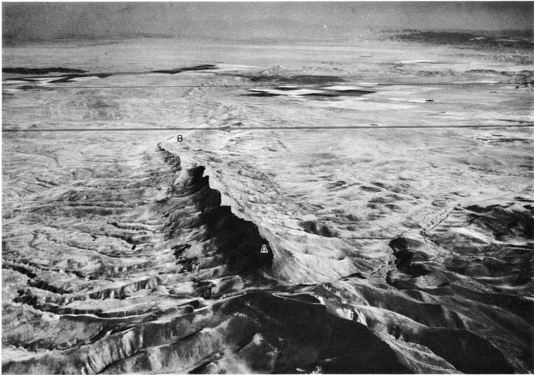
View south along crest of Reef Ridge toward Pyramid Hills and San Joaquin Valley. Resistant Temblor sandstone forms crest of dark ridge in foreground (A), while light ridge in middleground (B), is composed of unconformably overlying Monterey shale. Younger Pliocene formations extend toward Kettleman Plain on left.