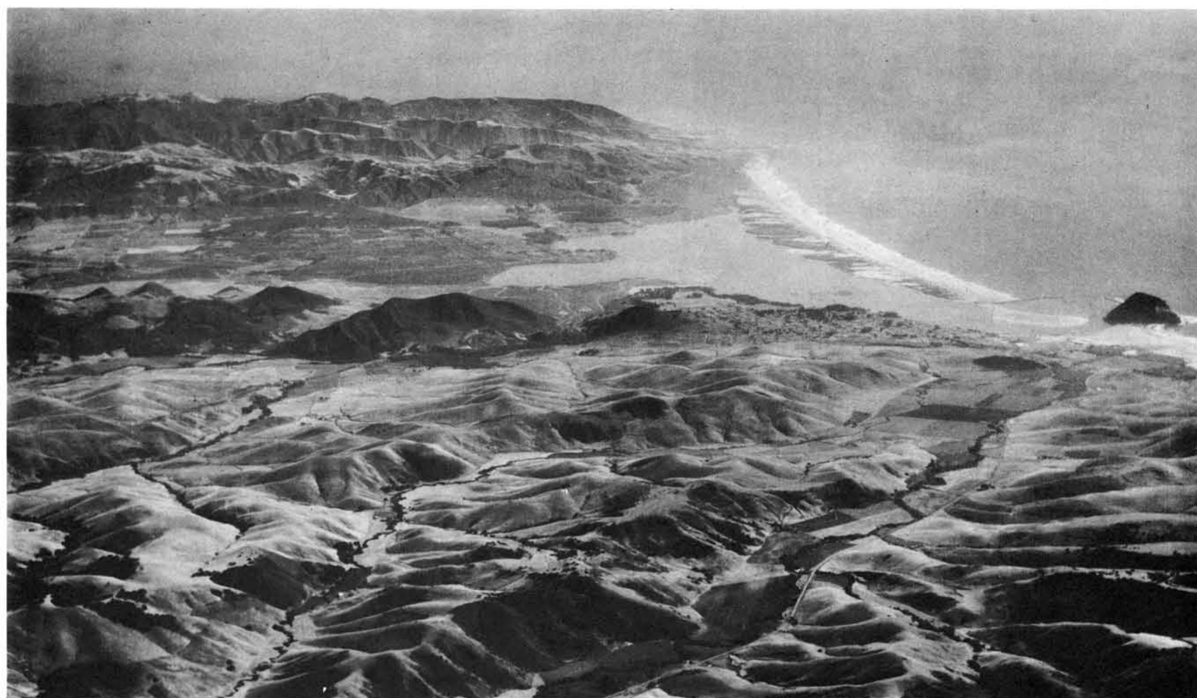
View southward to Morro Bay on the San Luis Obispo coast. Morro Rock, a seastack on the extreme right, is one of a group of aligned volcanic plugs appearing as dark hills in the middleground. Beyond Morro Rock, a baymouth bar separates Morro Bay from the open Pacific Ocean. Franciscan formation and associated serpentine intrusive rocks are exposed in the foreground. The dissected San Luis Range in the distance is composed largely of the Monterey formation.