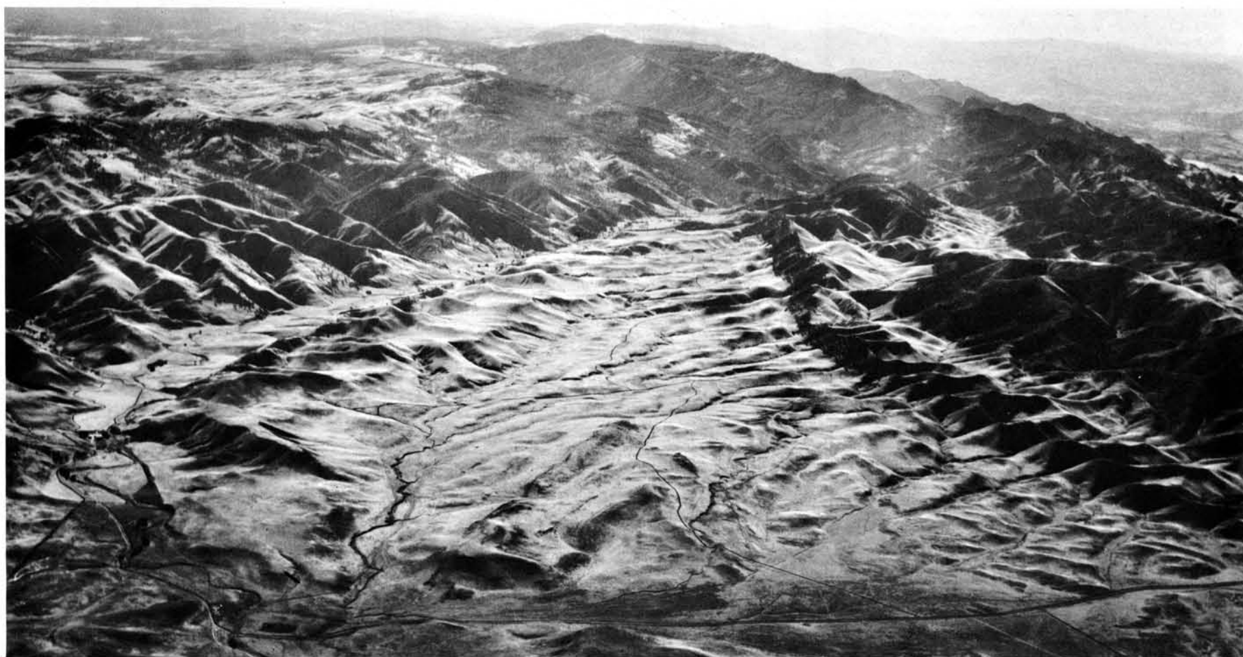
Aerial view northwestward along axis of McLure Valley syncline. Pliocene Jacalitos formation in center middleground flanked by upper Miocene McLure shale and Upper Cretaceous Panoche sandstone and shale.

For a complete list of published geologic maps of this area see California Div. Mines Special Report 52.